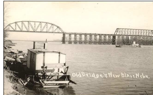
In 1924, the flat top train bridge was replaced by the round top Parker truss bridge.