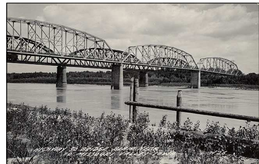
In 1929, the Abraham Lincoln Memorial Bridge was completed for car traffic just to the south of the railroad bridge.